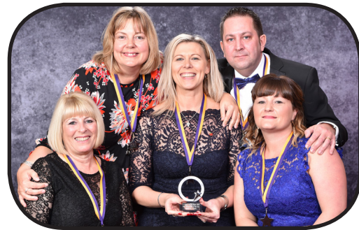
Non-clinical Team of the Year Saffron Team