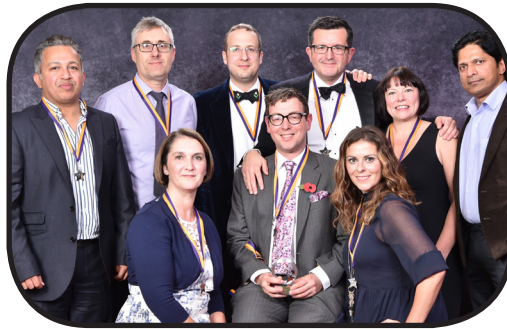
Organisational Improvement Through Innovation Placenta Accreta MDT