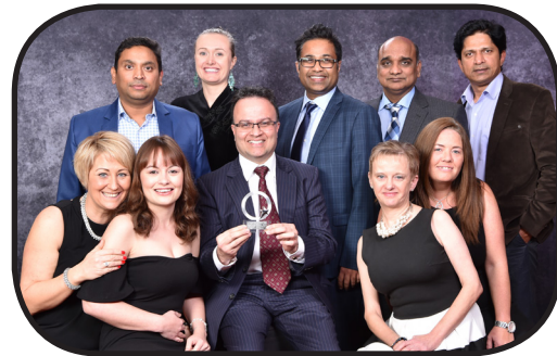
Improving Patient Care Through Innovation Bariatric Team