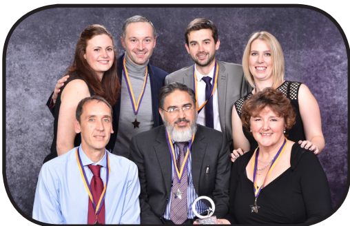
Clinical Team of the Year Radiotherapy