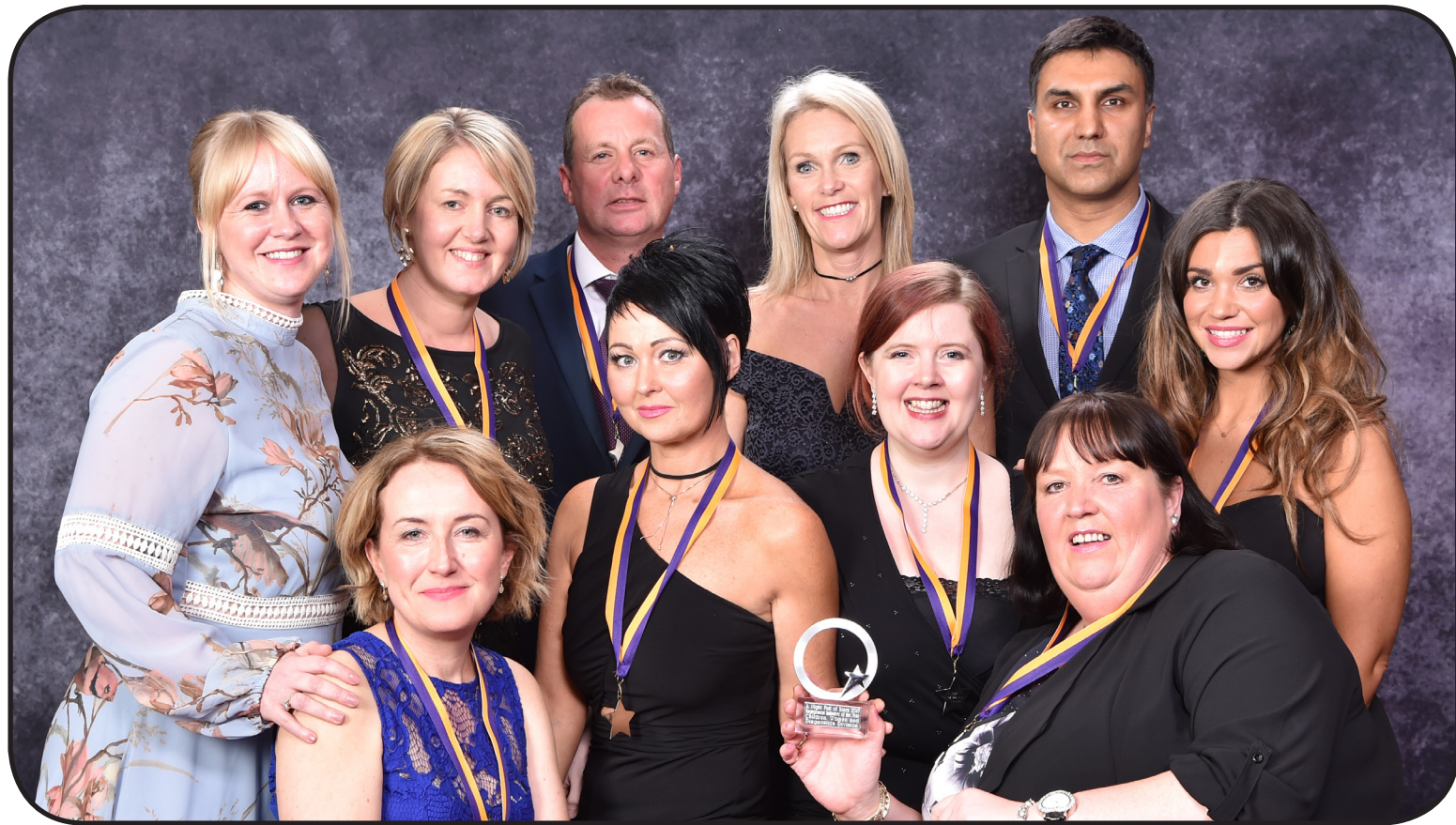
Engagement Initiative of the Year - Children, Women & Diagnostics Division and People & OD