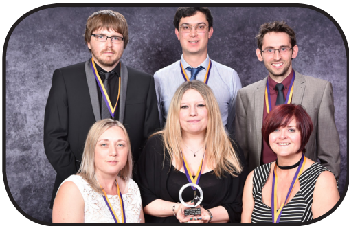
UHM Research Impact Pathology Clinical Trials Team