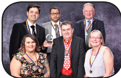
Innovation in Education & Learning Endoscopy